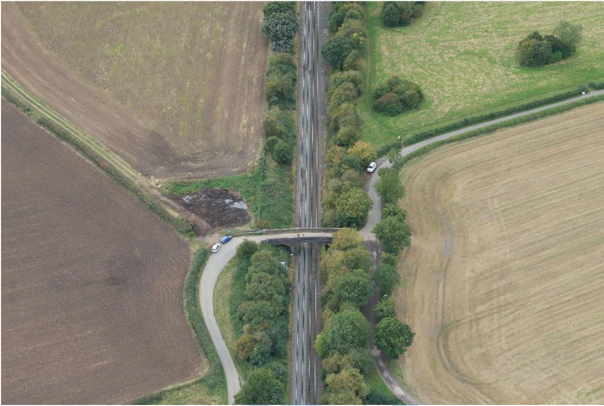
Burbage Common Road Overbridge (Existing)